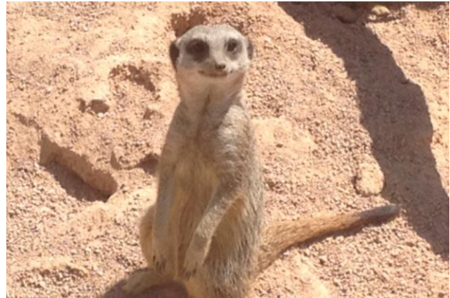
The Animal Experience - West Midlands Safari Park and Trentham Monkey Forest