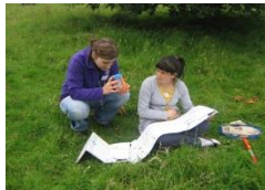
Searching for bugs and trying to identify them