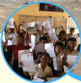
SGB Cambodia: Chi Phat Village, Koh Kong Province, Cambodia.

From 2002 to present, pupils and staff at SGB have shown care for the wider community by supporting a primary school in rural Cambodia.